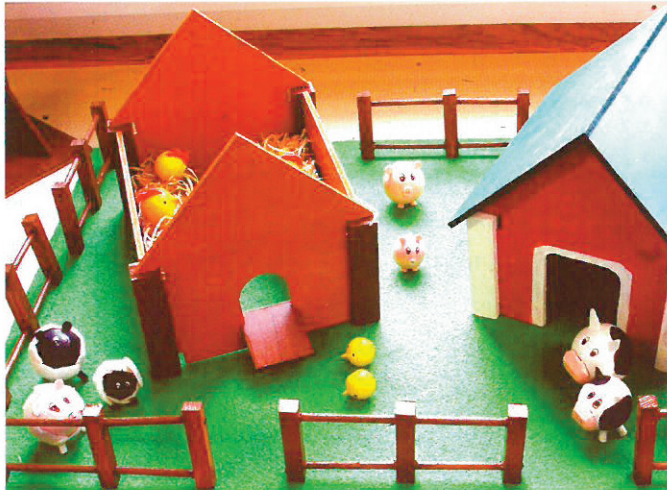
Farmyard Set: Designed and crafted by Dominique Duplain