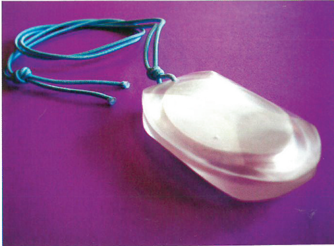
Acrylic Etched Locket: Designed and crafted by Lucy Maye