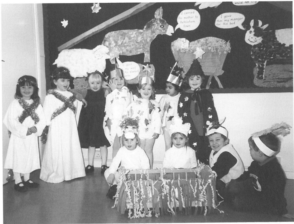
Nursery Christmas play, 'The Legend of the Little Fir Tree'