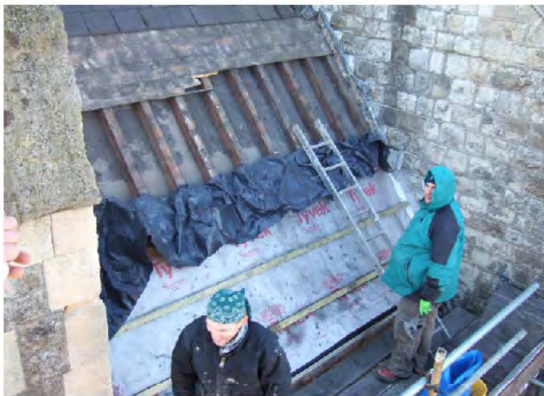
The Chancel roof, north slope

The renovations will allow the beautiful stained glass window at the east end to be visible in all its glory once more and we, like you, will be absolutely delighted to see the back of the scaffolding!